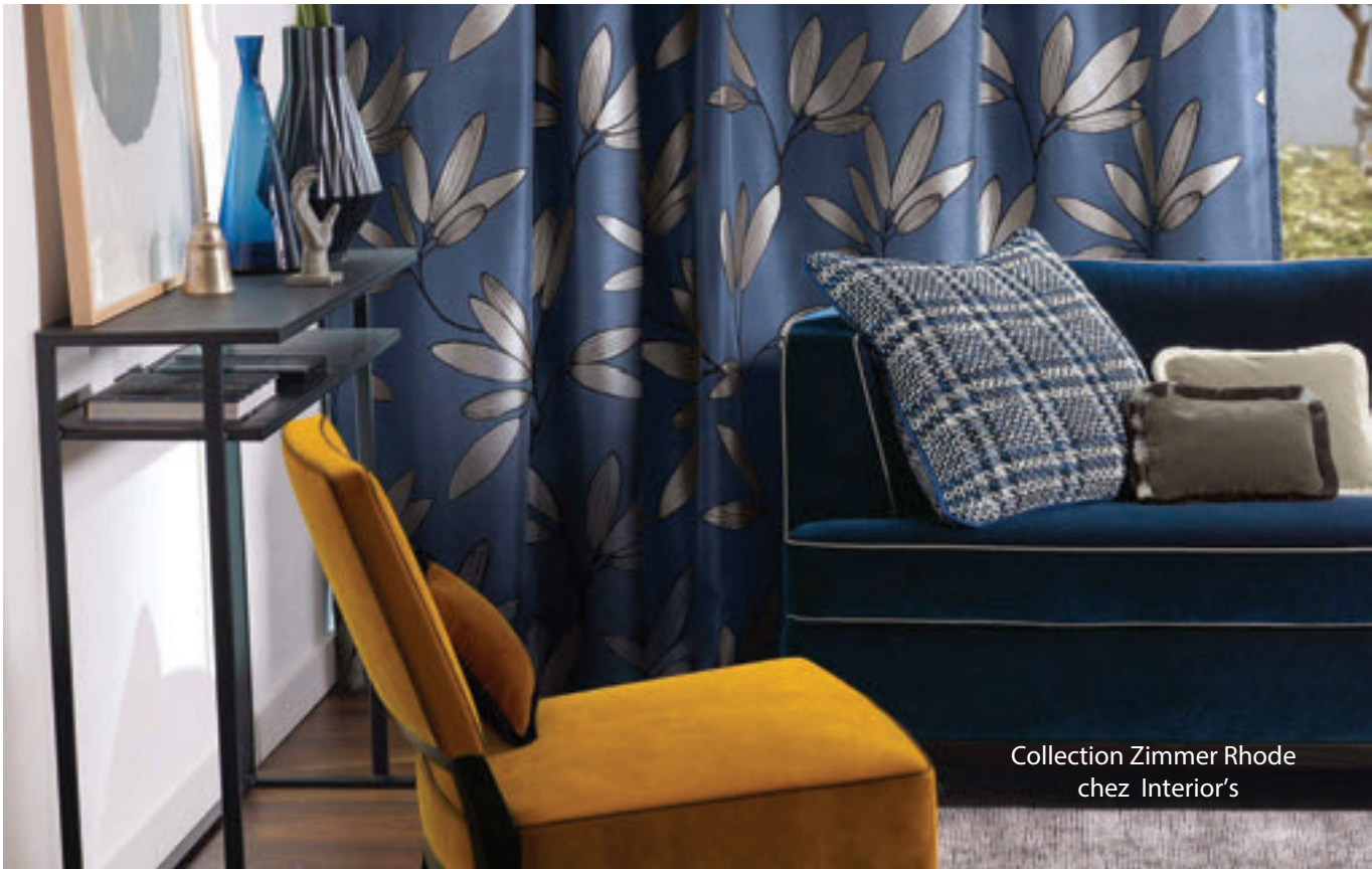
Collection Zimmer Rhode chez Interior's