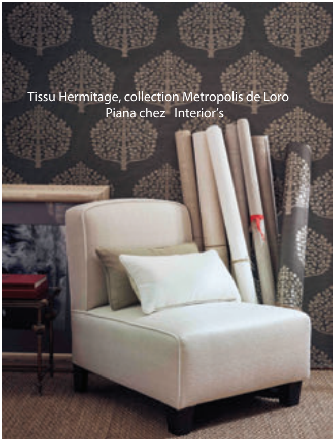
Tissu Hermitage, collection Metropolis de Loro Piana chez Interior's